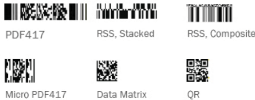
Figure 2: Examples of bar codes and symbols

Some manufacturing environments use a workaround by mounting the reader after applying a special anti-static spray for protection. There are two problems with this attempted solution: the coating must completely cover the area for maximum effectiveness and risk prevention, and anti-static sprays can wear off over time, requiring frequent reapplication. Without an accurate measure of a spray's efficacy period, companies either waste money by spraying too much or put their components at risk by exposing them to an unprotected environment.