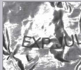
BEFORE CORRECT LIGHTING