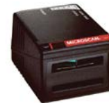
■ MS-9 Ultra-high speed scanner.