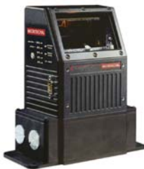
■ MS-890 Extended read range scanner with easy wiring box option.