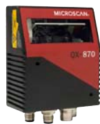
■ QX-870 Sweeping raster scanner with industrial protocols.